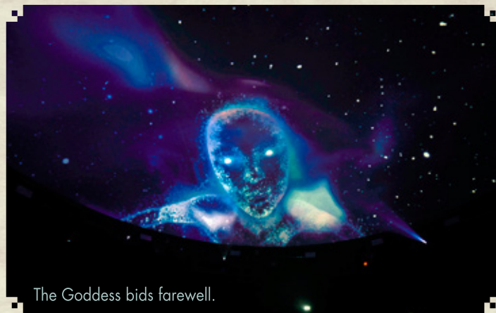
The Goddess bids farewell.