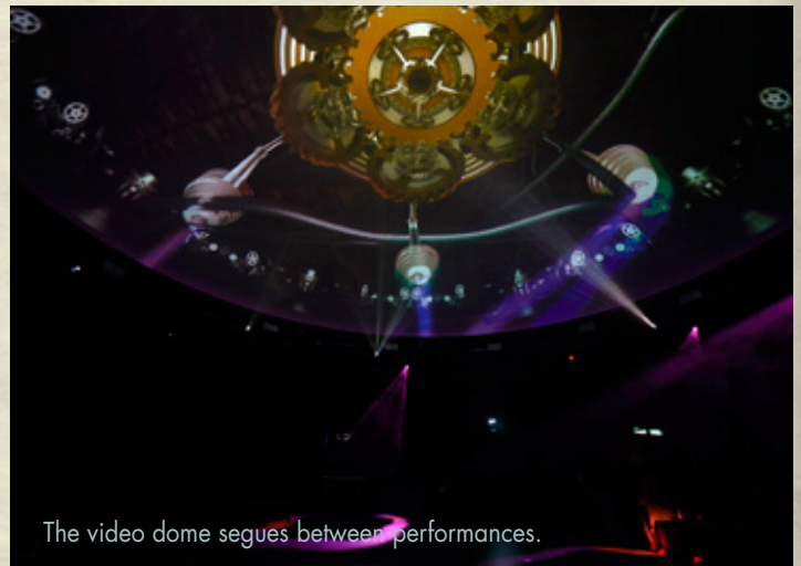
The video dome segues between performances.

thing special, “like a new Magic Castle — the Magic Castle reinvented — to showcase magic in a cool environment.”