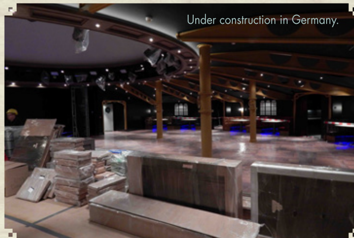
Under construction in Germany.