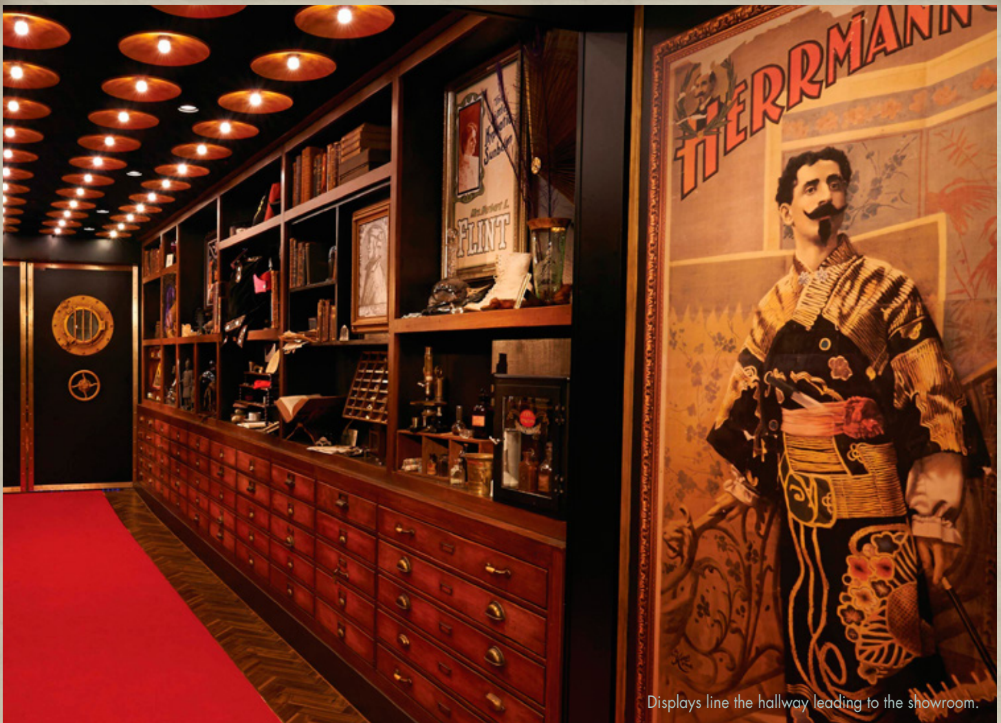
Displays line the hallway leading to the showroom.

actly as planned, he finally performs a hilarious but clever act and wins the competition.