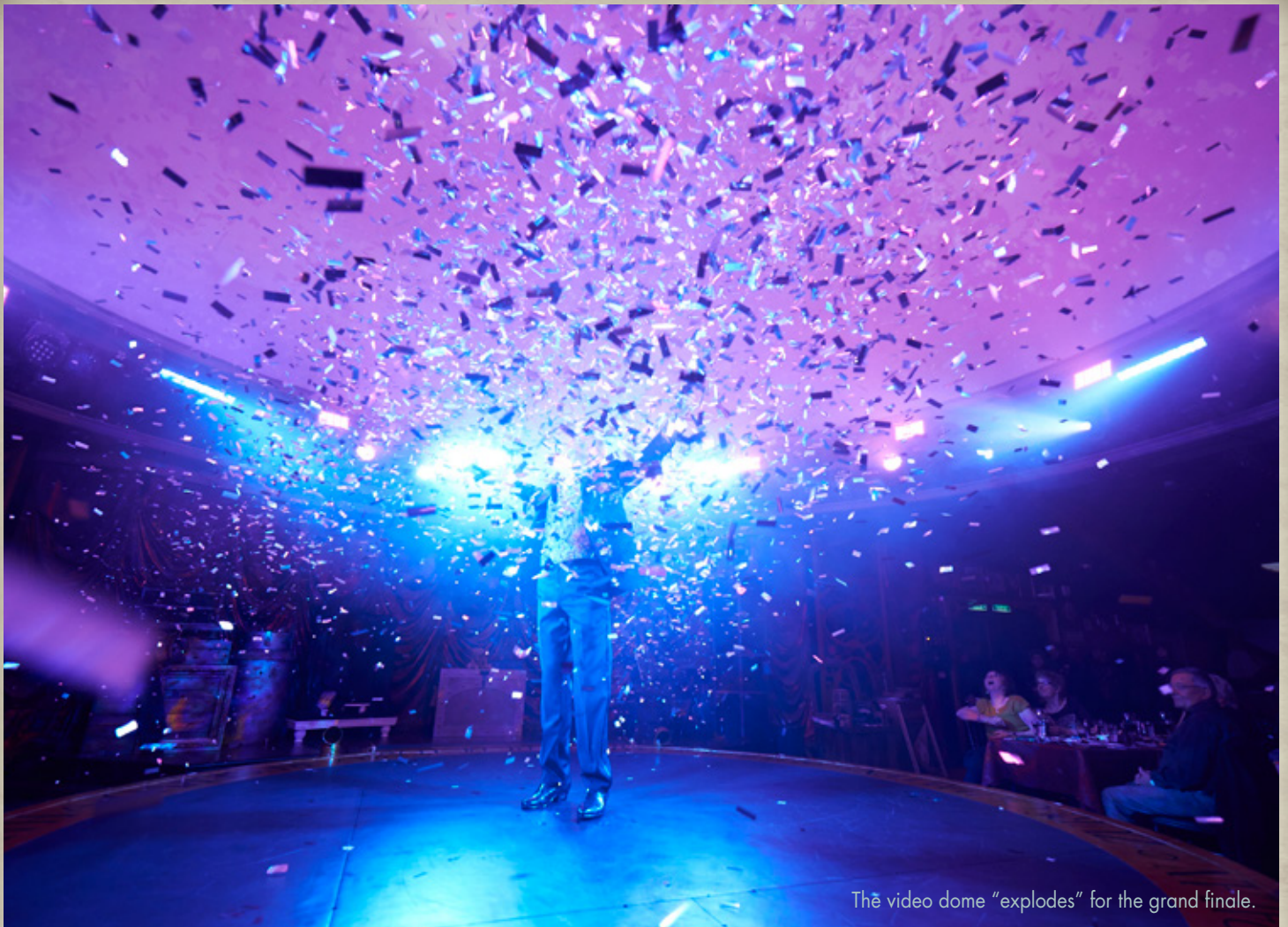
The video dome “explodes” for the grand finale.

adds, “Honestly, it’s probably the monotony of the job, going to the same places over and over again.” Of course, if you have to visit the same places over and over again each week, Miami, St. Maarten, St. Thomas, and the Bahamas are not that bad.