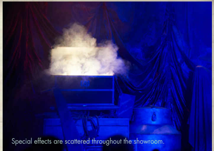
Special effects are scattered throughout the showroom.